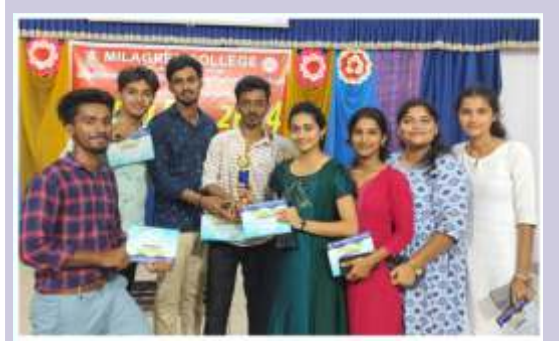
SECOND PLACE WIN IN THE ICE BREAKER EVENT