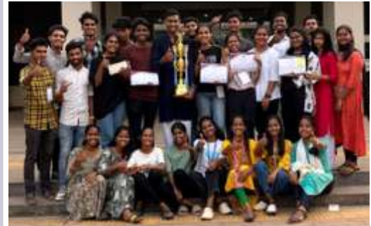
Over all Runner -Up at Nitte NU- CHROME 2024